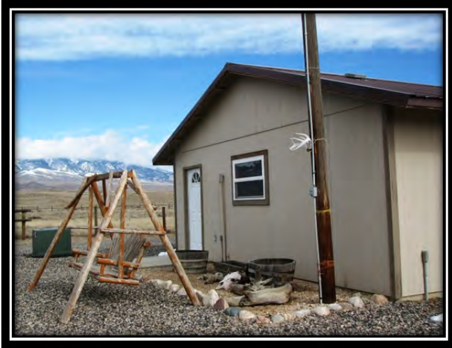
2 Car Oversized Garage